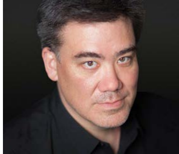
Artist-in-Residence Alan Gilbert

And that's just the beginning! Read on, and then please join us for what is sure to be another splendid musical summer season at the Santa Fe Chamber Music Festival.