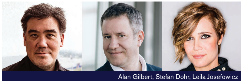
Alan Gilbert, Stefan Dohr, Leila Josefowicz

▶ Composer, conductor, and chansonnier HK Gruber partners with Kirill Gerstein for songs by Weill and Eisler, and he performs one of his own works, Frankenstein!! , with a chamber orchestra led by Santa Fe Symphony Principal Conductor Guillermo Figueroa .